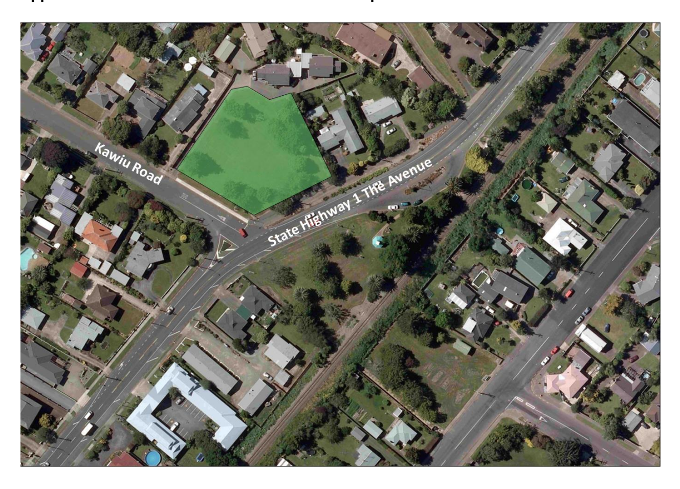
Appendix 3 - Kawiu Corner Reserve Location Map