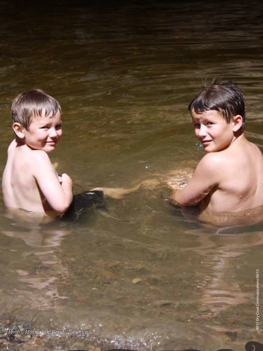
Photo: Horseshoe Bend, Tokomaru