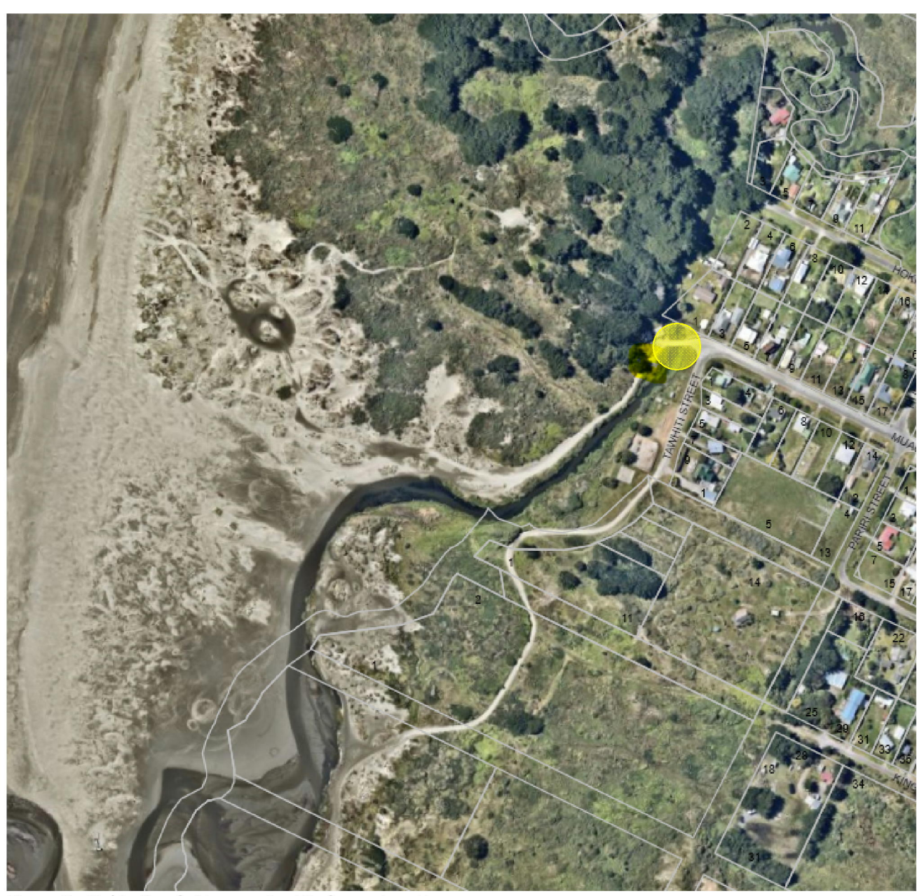
Figure 3: Hokio Beach Stormwater Discharge Location