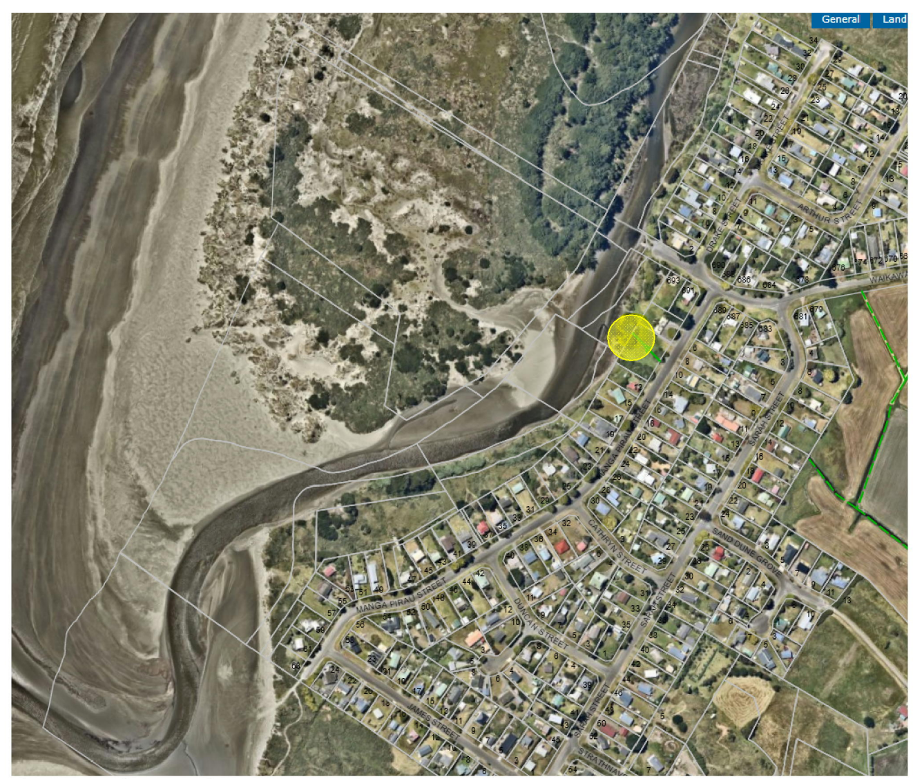
Figure 4: Waikawa Beach Stormwater Discharge Location

3. Does the council hold any data/statistics/reports on recreational activities within the common marine and coastal area? For instance, the numbers of people who swim/picnic/surf/fish/etc.? If so, can these be made available?