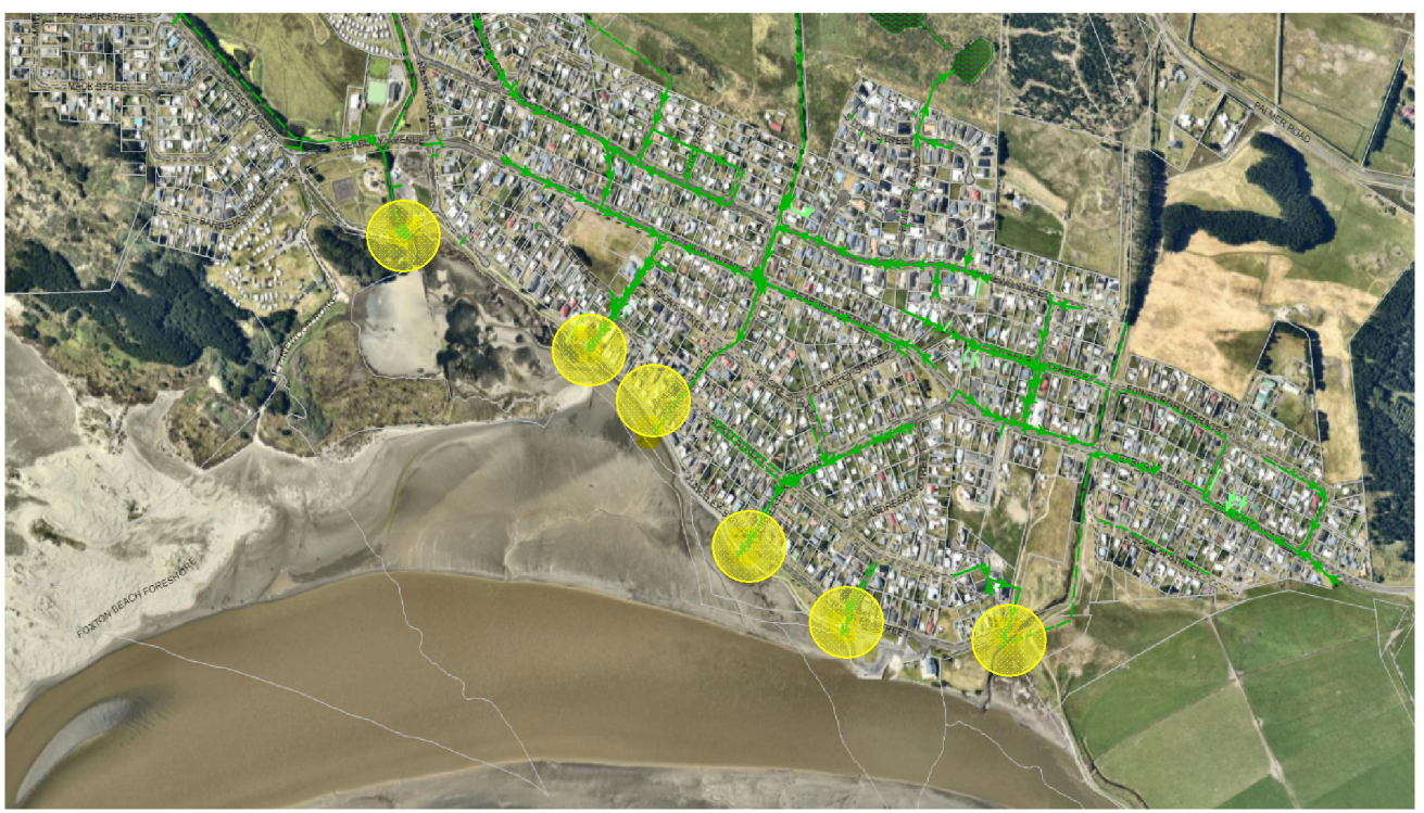
Figure 1: Foxton Beach Stormwater Discharge Locations

The locations of the above are highlighted in yellow in the following figures.