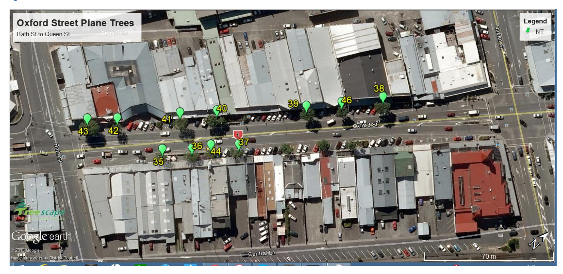
Figure 2- Notable Planetree locations.