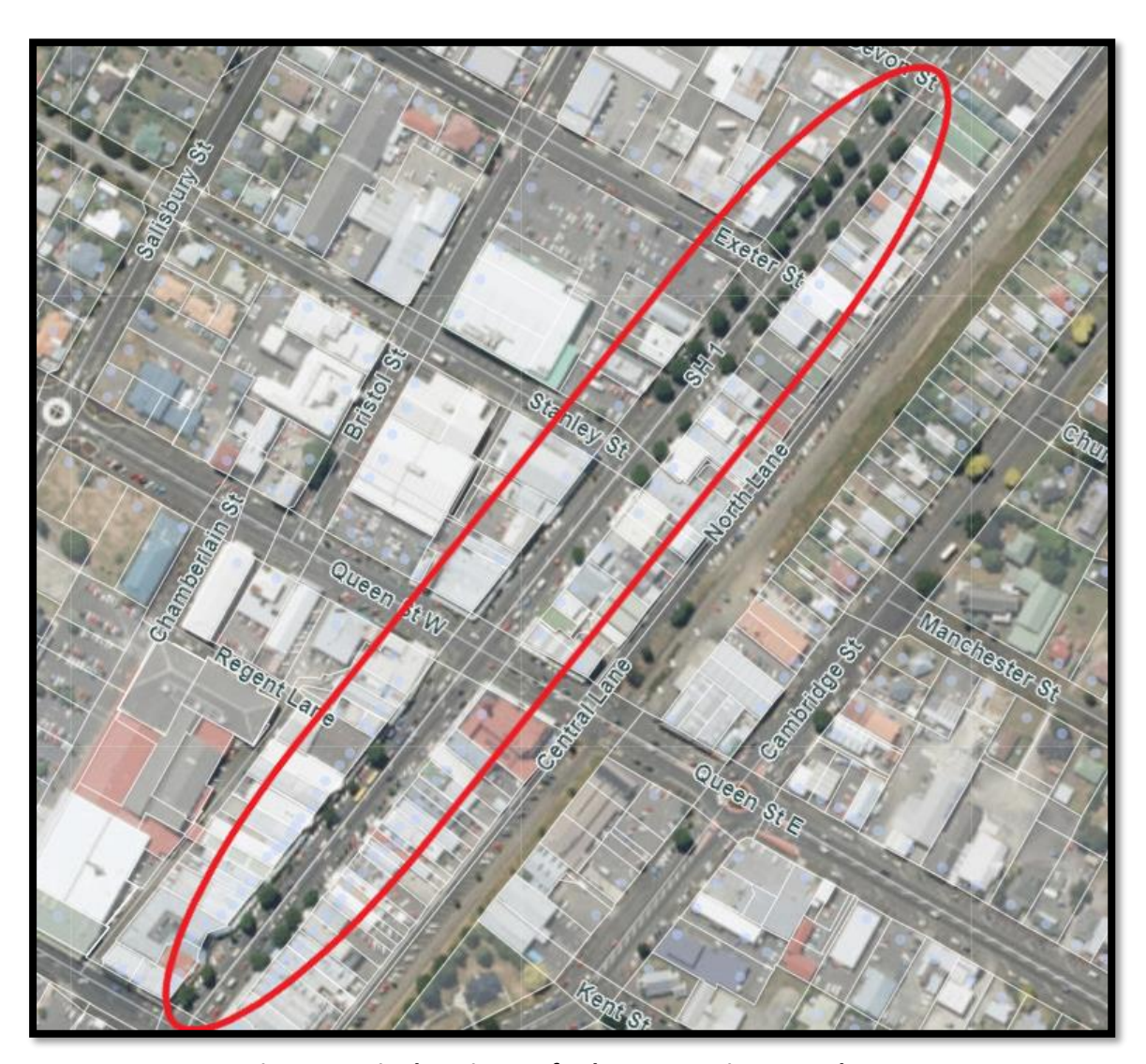
Figure 1 - Site location, Oxford Street, Levin, Horowhenua

6. Figure 1 below, shows the site location