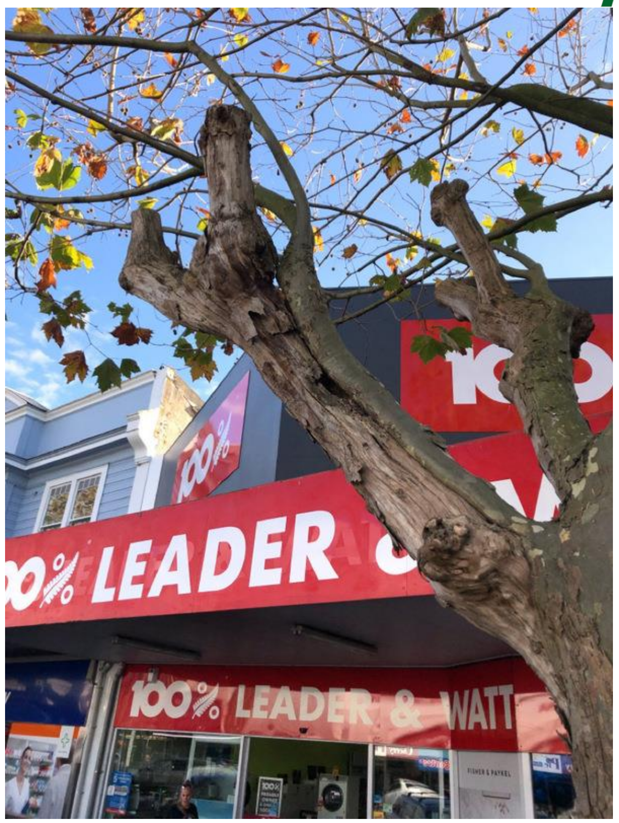
Photograph 2 - Tree 24