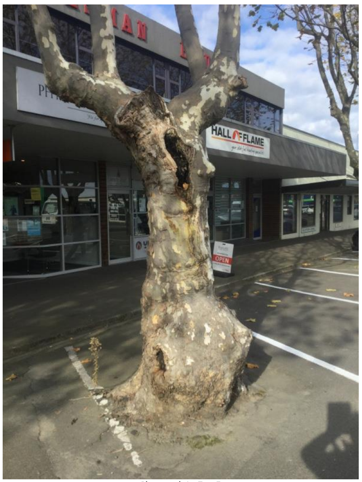
Photograph 1 – Tree 7