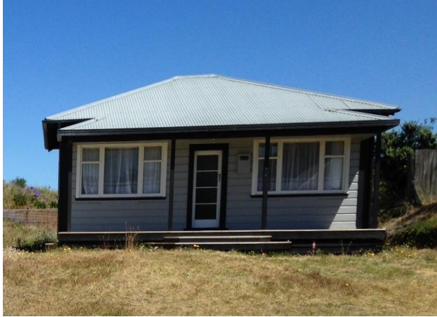
West Elevation (facing street)