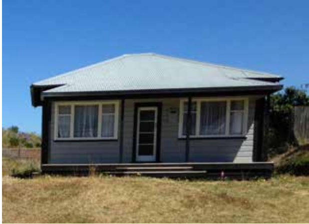
West Elevation (facing street)