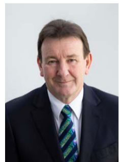
Mayor Bernie Wanden