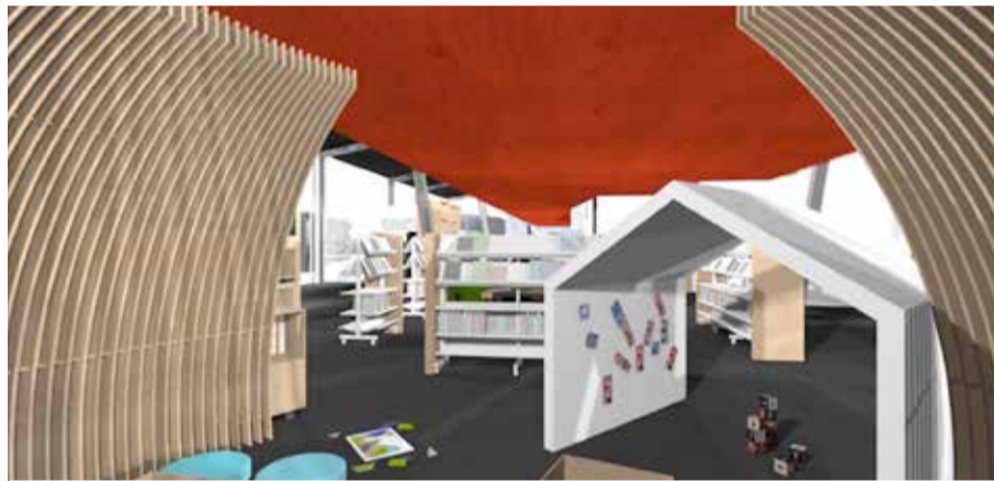
A dedicated play space for children.