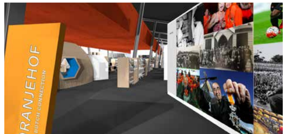
The entry to Oranjehof, the national Dutch Connection Museum, where exhibitions will highlight the major influence the Dutch community has had on the development of New Zealand.