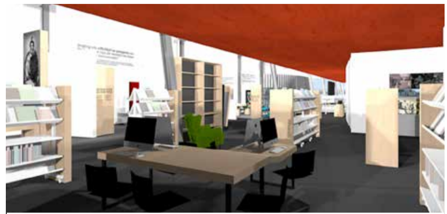
Inside the Foxton Library.