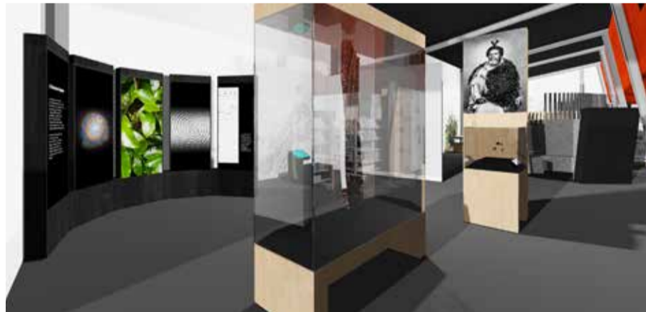
Inside the Piriharakeke Generation Inspiration Centre; celebrating local stories and aspirations, with a focus on Ngāti Raukawa ki te Tonga and its hapū who have links to Te Awahou (Foxton).