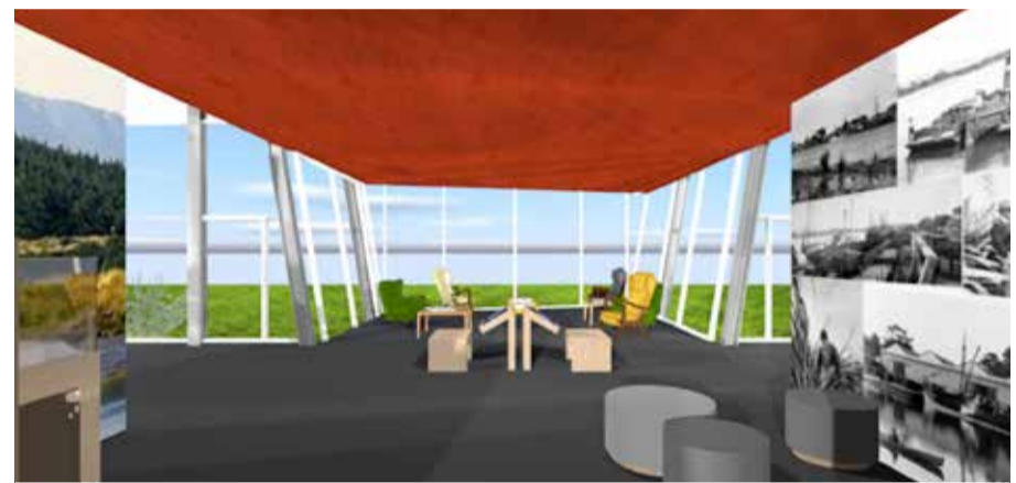
An upstairs lounge in the mezzanine area.