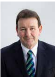
Mayor Bernie Wanden