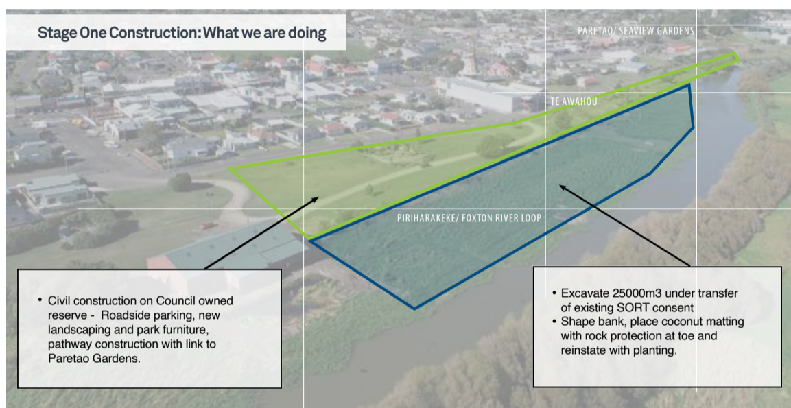
Artist's impression of the area where silt and vegetation will be removed from.

The project is expected to be completed by the end of January 2021 subject to weather and Covid-19 restrictions.