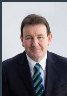
Mayor Bernie Wanden