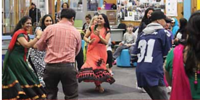
Garba Dance in the Youth Space

Don't forget to sign up for the Reverse Colour Run while you are there!