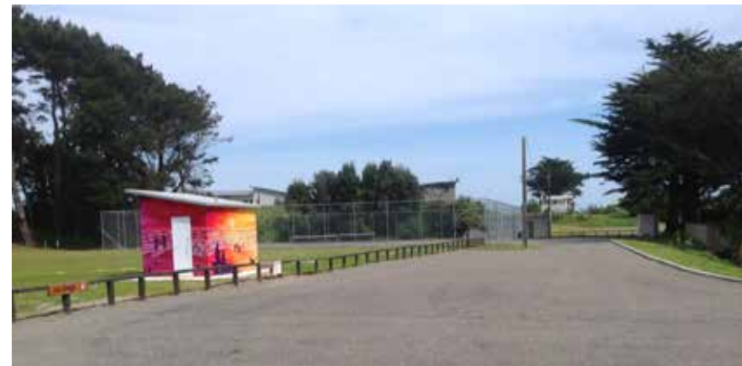
Image 6 Sealed car park, toilet and tennis courts (in the distance)

Provide appropriate facilities to support the function and use of the Domain.