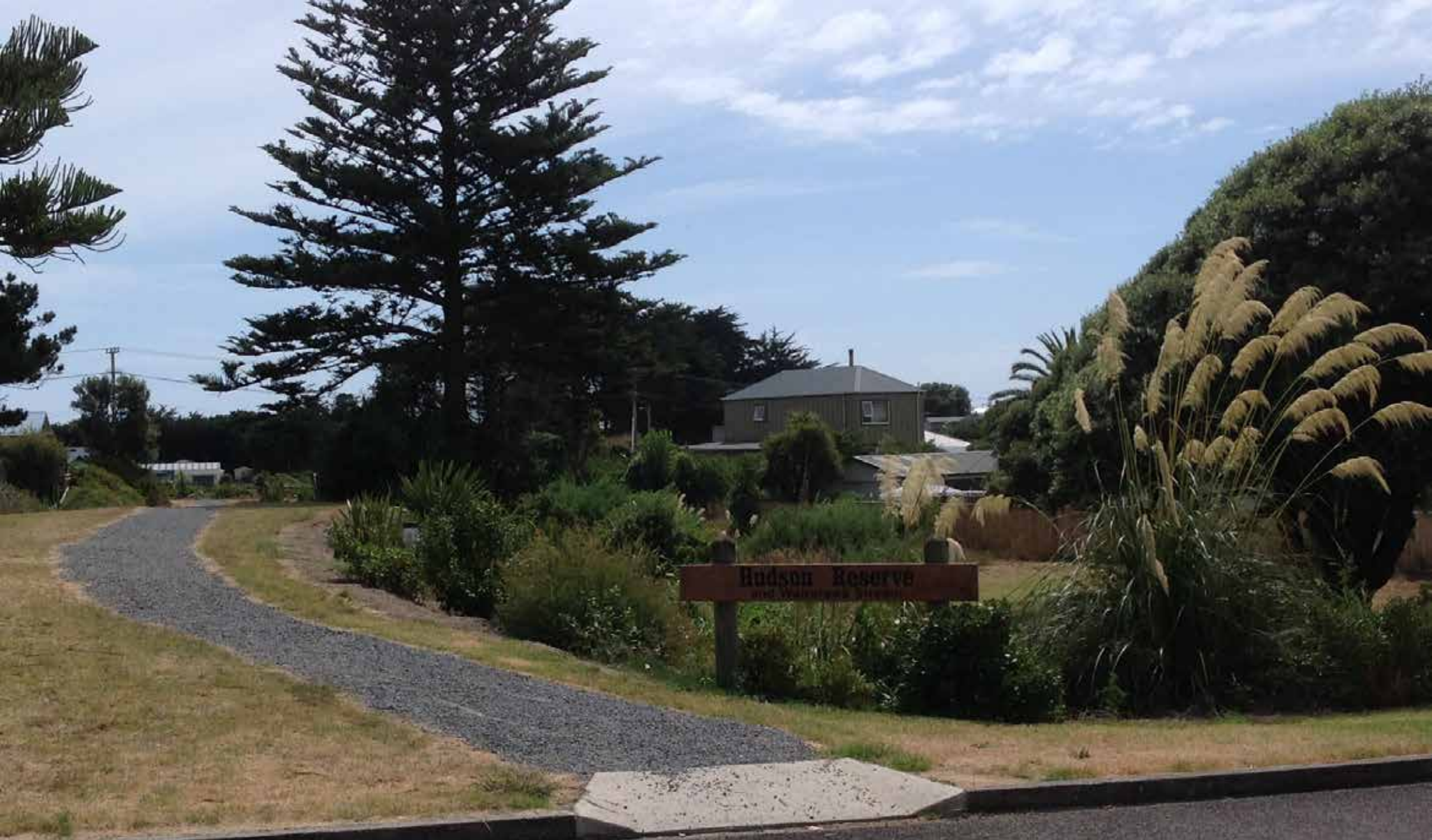
Wairarawa Stream Reserve (and Hudson Reserve)