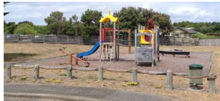
Image 4 Playground at Holmwood Park