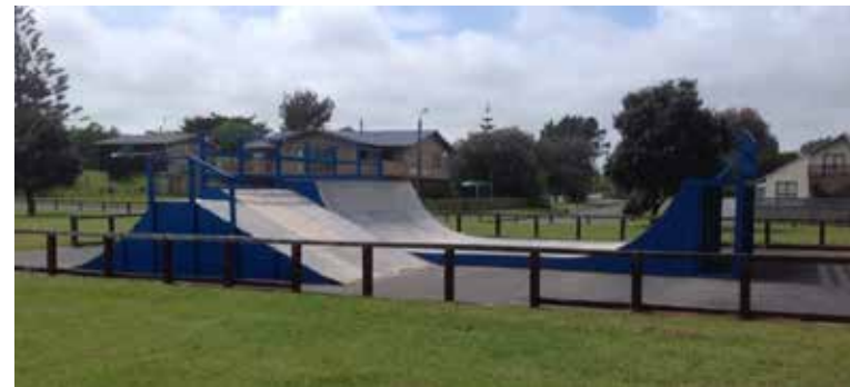
Image 8 Skate ramp and half-pipe on Waitarere Domain