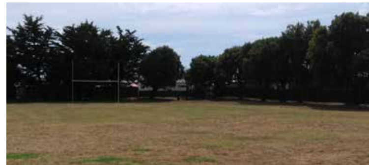
Image 11 Grassed, open space area, with rugby goal in the distance