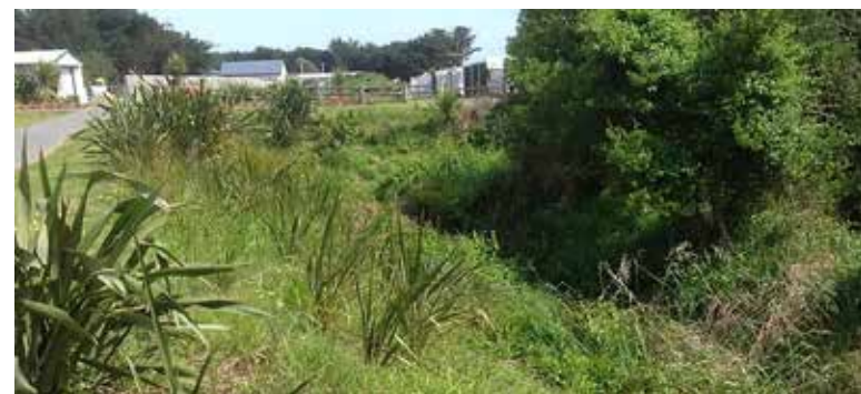
Image 18 Existing riparian planting along Wairarawa Stream