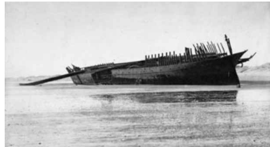
Image 14 Wreck of the Hydrabad (photo taken on 10 June 1935. Source: Alexander Turnbull Library)

Note: The level of importance assigned to each action above is based on the context of this reserve and has not been considered in relation to levels of importance assigned to other reserves in the District.