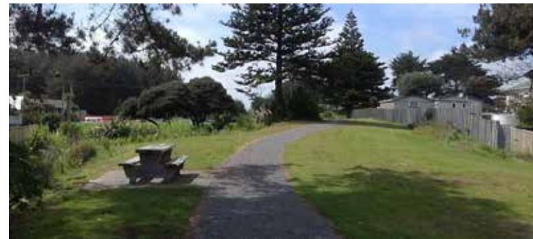
Image 17 Picnic table and walkway at Wairarawa Stream Reserve