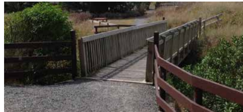
Image 16 Pedestrian bridge which crosses Wairarawa Stream near Somerset Grove

Work with the community and relevant landowners to explore future development opportunities for the Wairarawa Stream Reserve.