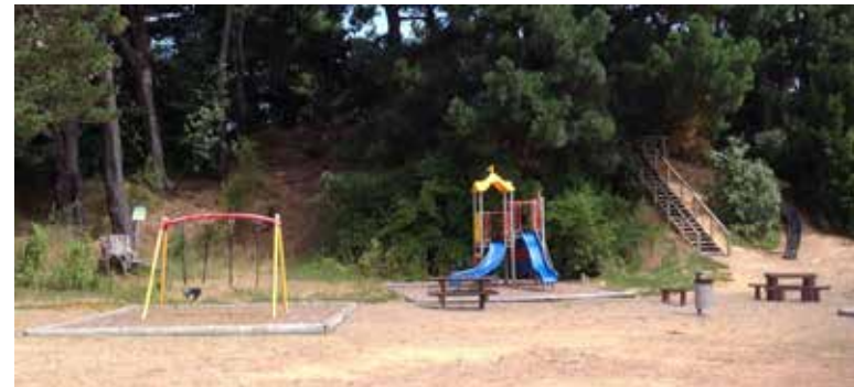
Image 3 Play equipment at Waitarere Domain