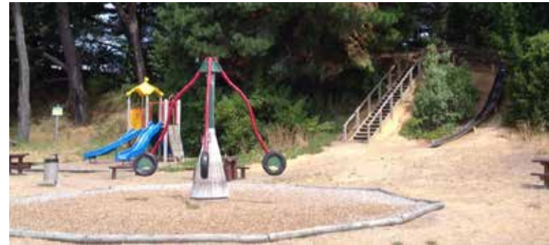
Image 2 Play equipment at Waitarere Domain

As Council plans for the future development of its reserves at Waitarere Beach, it will need to undertake further investigation to establish whether an additional playground is required.