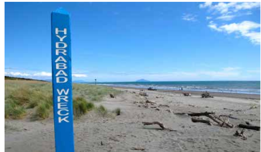
Image 15 Sign at location of Hydrabad Shipwreck (photo taken in 2012 )