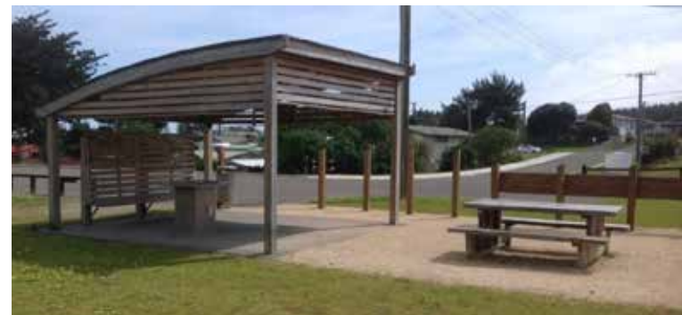
Image 9 BBQ/picnic area on Waitarere Domain