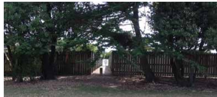
Image 12 Access way to the Park from Rua Avenue