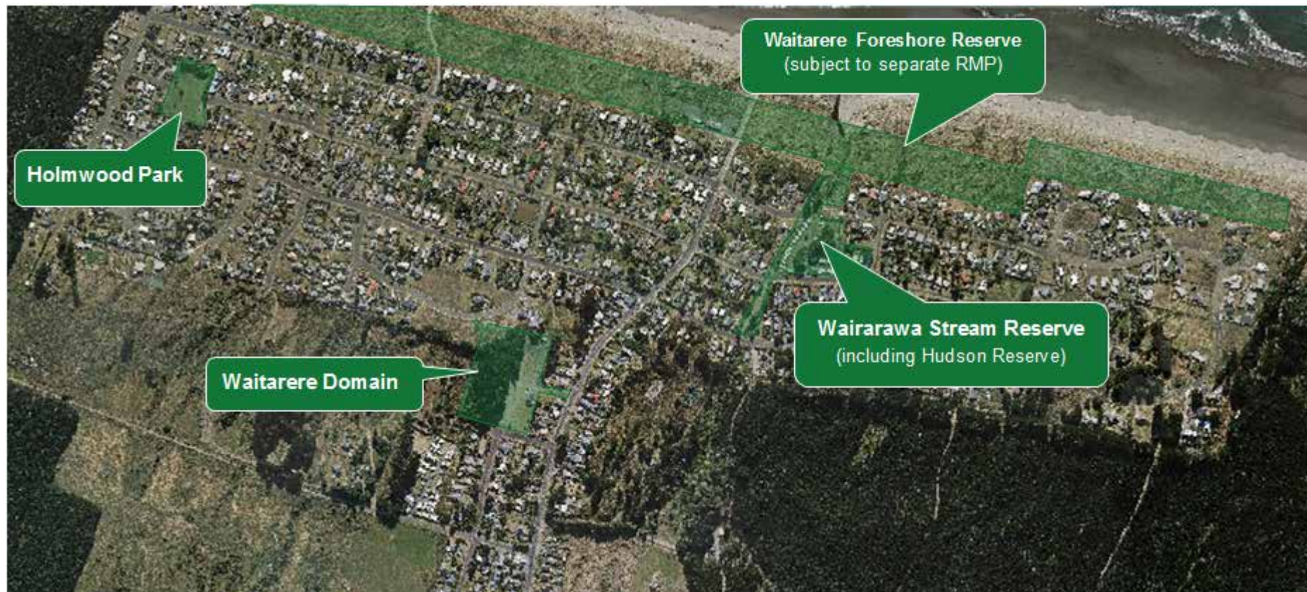
Image 1 Aerial Photo taken in 2016 of the main residential area of Waitarere Beach, with key reserves labelled.

Waitarere Beach is a small, coastal town situated on the west coast, in the Horowhenua District. This township is located south of the Manawatu River and north of the District's main urban centre, Levin. The usual population of Waitarere Beach was 588 in 2013, with approximately 300 occupied dwellings and 486 unoccupied dwellings (Statistics New Zealand, 2013 Census). These figures illustrate that this beach community has a high number of holiday homes. This beach side community is a popular spot for visitors from within and outside of the District. Resident and visitor populations have access to a number of reserves, as shown in the below image.