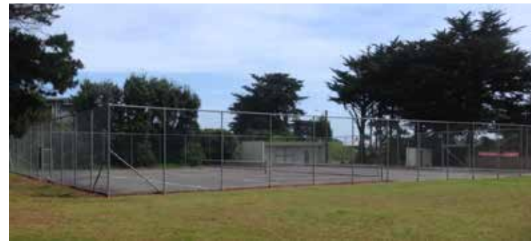
Image 7 Tennis Courts on Waitarere Domain

Note: The level of importance assigned to each action above is based on the context of this reserve and has not been considered in relation to levels of importance assigned to other reserves in the District.