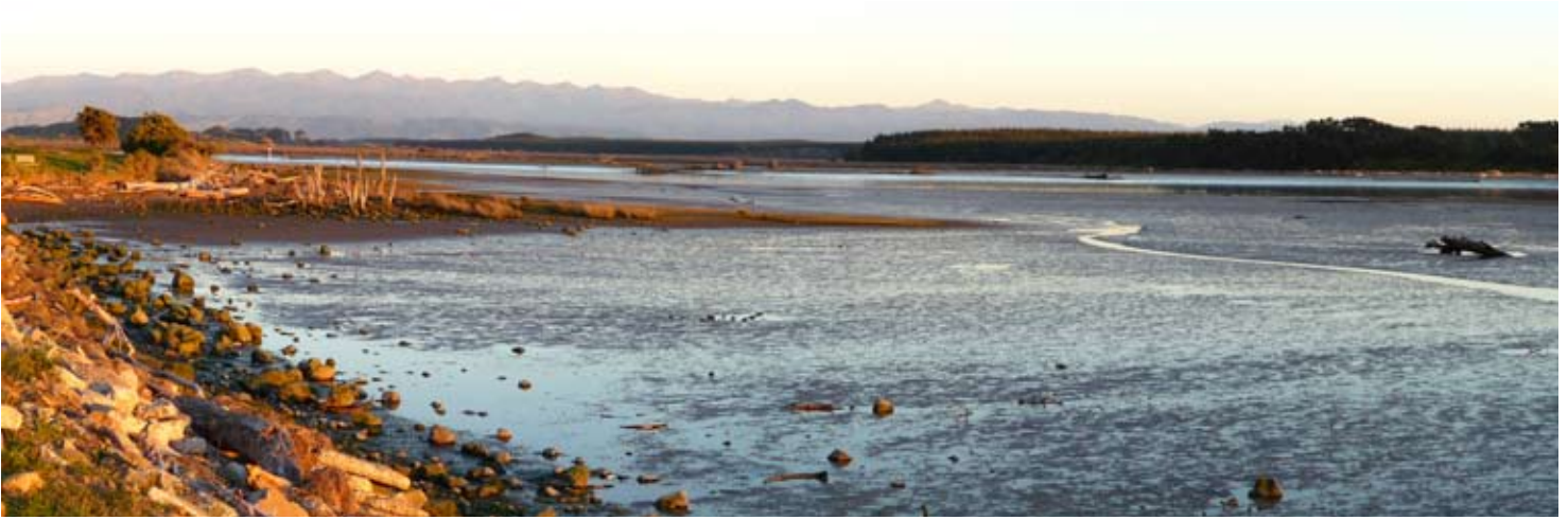
Proposed Outstanding Natural Landscape – Manawatu Estuary.